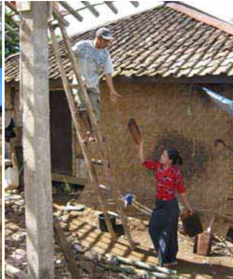
A woman from Bungbangsari village participating in the reconstruction of her house