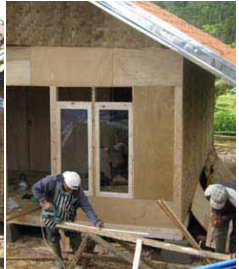
Construction workers in Bungbangsari Village.