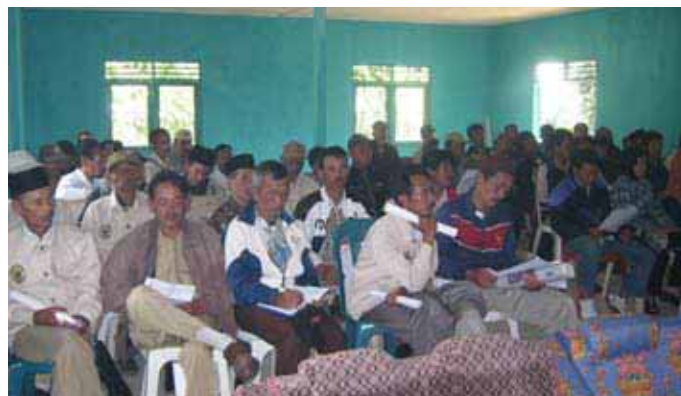
Program socialization with people of Hegarmanah Village before conducting house reconstruction.

Solidarity, mutual support, sharing and caring for each other made this program implementation enjoyable. Con-