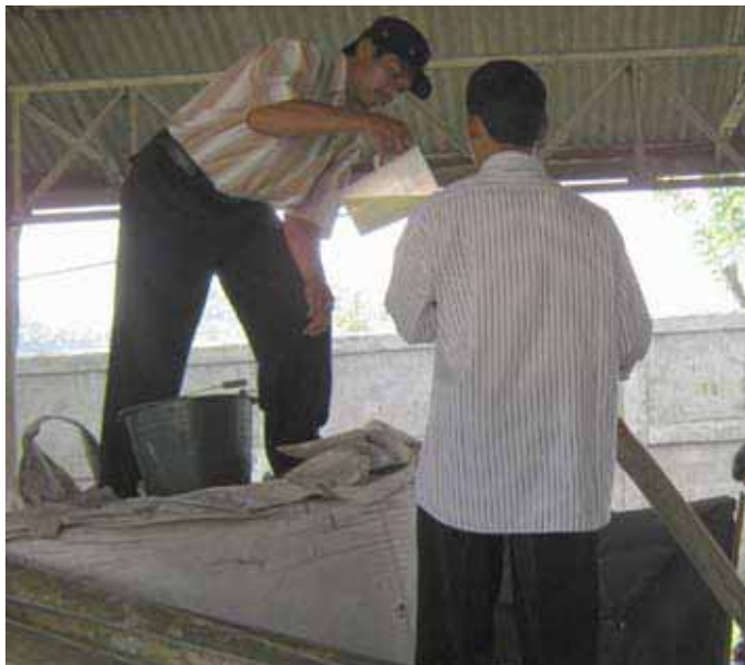
Bamboo preservation Training for construction workers.

The craftsmen's longing for knowledge was expressed by their enthusiasm during the training. The training presented knowledge in a way that aimed to be most practical and relevant to the needs of communities and the availability of local material.