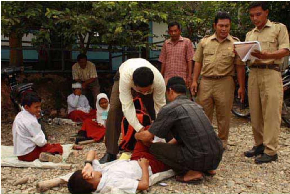
Emergency First Aid (PPGD) was given to the injured.

vention program of JRS Indonesia in South Aceh District. Pulo Kambing Village is one of 13 JRS assisted villages in which JRS accompanied community, youth, students and teachers in becoming more resilient towards hazards from natural and man made disasters. The program in these 13 villages is planned to be completed in June 2010. The simulation exercise was conducted to see in how far the community is prepared to face a disaster after nearly 1.5 years receiving training on DRR, EPS (Emergency Preparedness System), PPGD (Emergency First Aid) as well as having gained practical skills and knowledge on how to manage disaster risks.