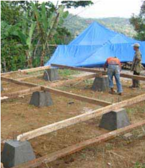
A good foundation is the basis of an earthquake resistant house.